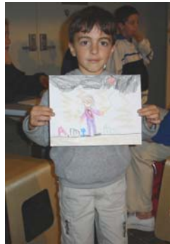
April 22 NPS Week Program

help kick-off National Park Week. Families got to take on the role of historians researching 18 th century life in the Historians in the Making Learning Lab. They also got the opportunity to color a Liberty Bell, an NPS arrowhead, or create an original artwork having to do with an NPS site.