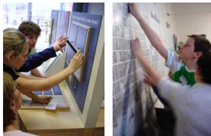
Historians in the Making Learning Lab at the Independence Living History Center

The Daily Life and Diversity in 18 th Century Philadelphia program is ready for your class. In this program, students get to take on the role of historians as they research the 18 th century using hands on activities and primary source documents.