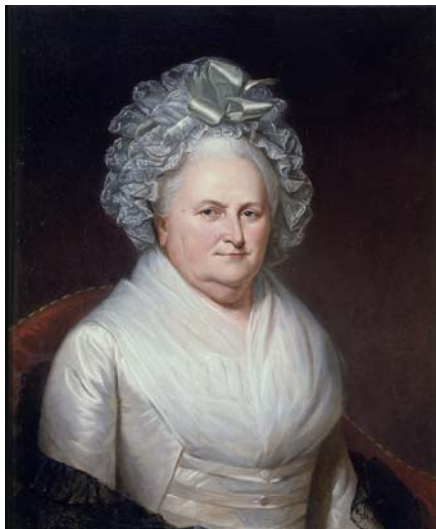
Title: Martha Dandridge Custis (Mrs. George) Washington Artist: Charles Willson Peale, from life, 1795 Location: Gallery #1— A Vibrant City Think about it: The First Lady had the task of overseeing a house with over 30 people living there. Was this an easy job? Why or why not? Explain.