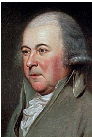
Title: John Adams Artist: Charles Willson Peale, from life, 1791-4 Location: Gallery #1— A Vibrant City (far left-hand side) Think about it: Adams spent years of his life in public service. Often, he was away from his dear wife Abigail. Do you think this was an easy decision on Adams’ part? Why or why not?