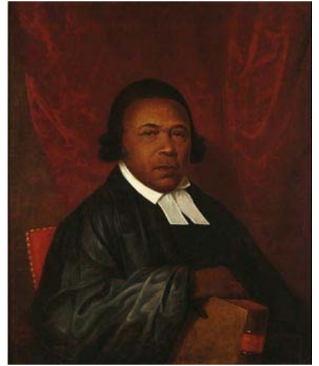
Title: Absalom Jones Artist: Raphaele Peale, 1810 Location: Gallery #4— Peale’s Museum (far left-hand side) Did you know? Jones was one of the founders of the Free African Society and the African Episcopal Church of St. Thomas in Philadelphia.