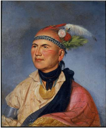
Title: Joseph Brant/Thayendanegea Artist: Charles Willson Peale, from life, 1797 Location: Gallery #1— A Vibrant City (right-hand side toward wall) Think about it: The artist painted this portrait the same year Thayendanegea toured Peale’s museum on Independence Square. Do you think the portrait shows the fear and respect that Thayendanegea commanded?